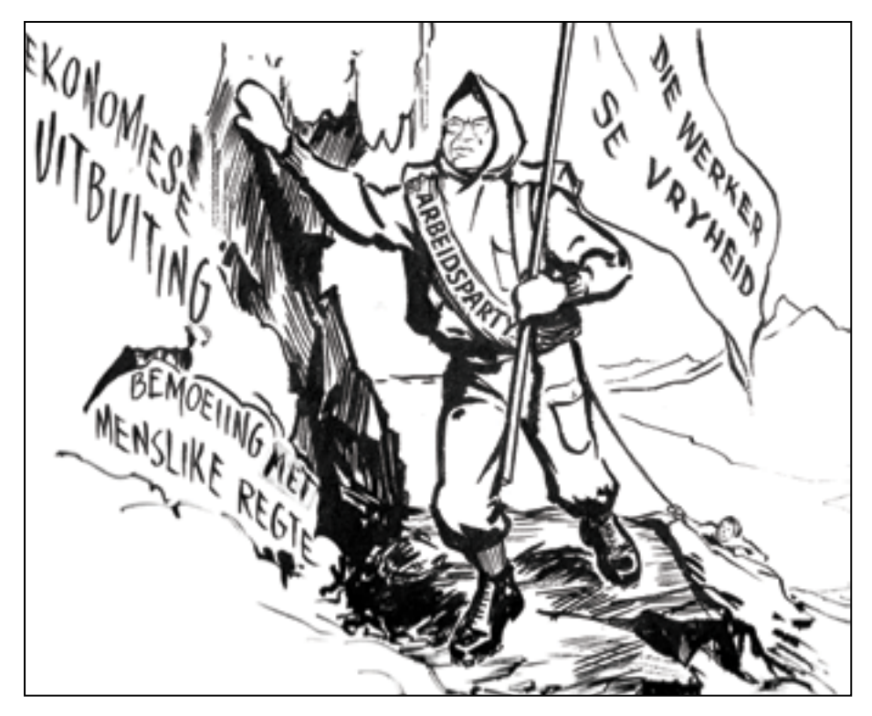
Cartoon by Ashton in Saamtrek, 'Met die Vlag Omhoog' , after the ascent of Everest in 1953, portraying Labour as holding the flag of the freedom of the worker against economic exploitation and interference with human rights.