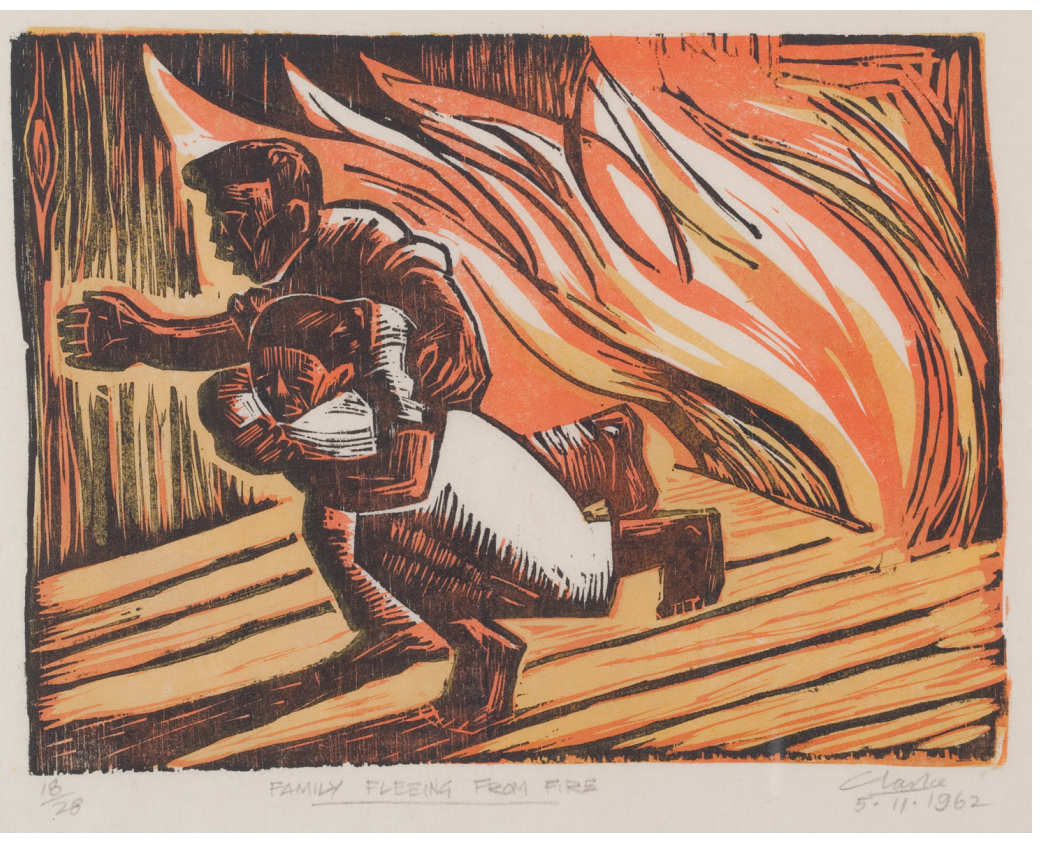
Peter Clarke, Family fleeing from fire , 1962. Wood and linocut. 190 x 250 mm. Private collection

Clarke is well known for his depictions of the social and political experiences of ordinary South Africans