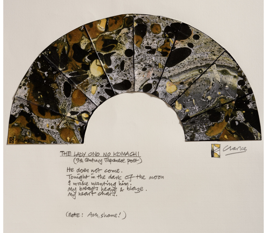
Peter Clarke, The Lady Ono No Komachi (9th century Japanese poet), 2007. Fan series: folded marbled paper with inscribed poem. 500 x 350 mm. Artist's collection

Clarke's more recent work includes the Fan series, each of which is accompanied by prose writing. These works are concerned with various historical, biblical and literary figures, as well as artists, such as Sam Nhlengethwa, Jackson Pollock and Piet Mondrian.