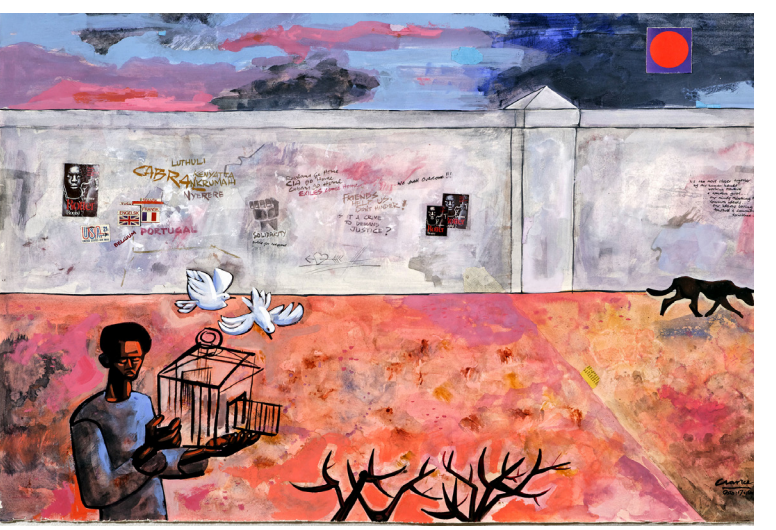
eter Clarke, Afrika which way? , 1978. Gouache and collage. 755 x 945 mm. Collection: William Humphreys Art Gallery

Get hold of a copy of the Bill of Responsibilities and discuss ways in which you and your classmates can apply this to your daily lives.