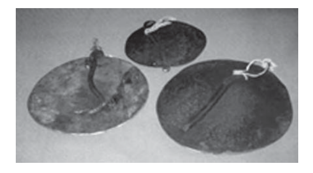
Figure 11.3 The qachel.