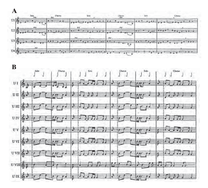
Figure 11.9 Wi'etus kimi mer'awee.

The following nine prayers are unmeasured and can be divided into two types. Here the musical instruments have an ornamental role. The beats are performed by the qachel in all the nine prayers. The gap between each of these beats prevents the possibility of exact measurement.<sup>30</sup>