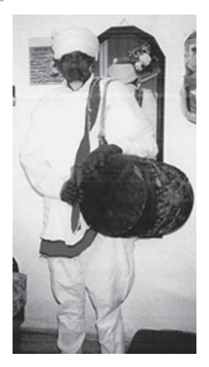
Figure 11.5 The kabaro.