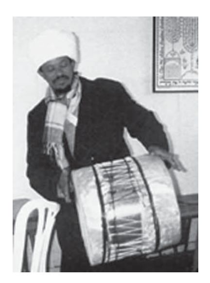
Figure 11.2 The nagarit.