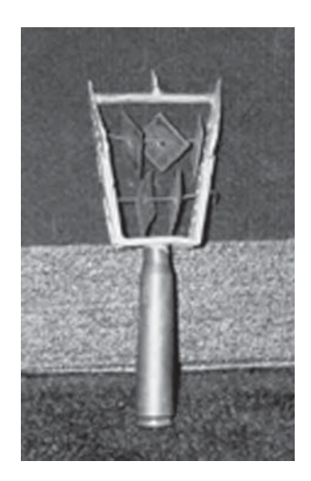
Figure 11.4 The senasel.