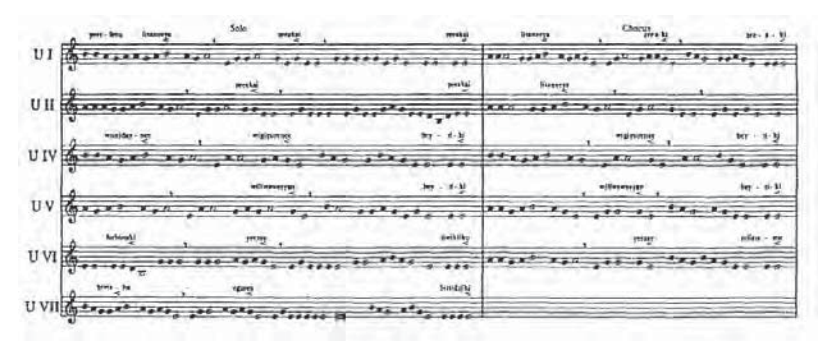
Figure 11.10 Yitfesa lisaneeya.

The two denominations that appear most frequently in the liturgy are unique for Beta Israel .<sup>31</sup> One denomination is Egzee'aviher . This is a combination of three words in Ge'ez, the meaning of which is 'the good and magnanimous God'. This denomination appears at the end of each musical unit in two of the four prayers ( Zegevre 1, Zegevre 2). The beat always appears on the word her ('good'). The second denomination is Herziga , or Herzigani . This denomination is in Agawegna dialect, unique to Beta Israel . As we can see the word her appears also in this denomination. The word Herziga