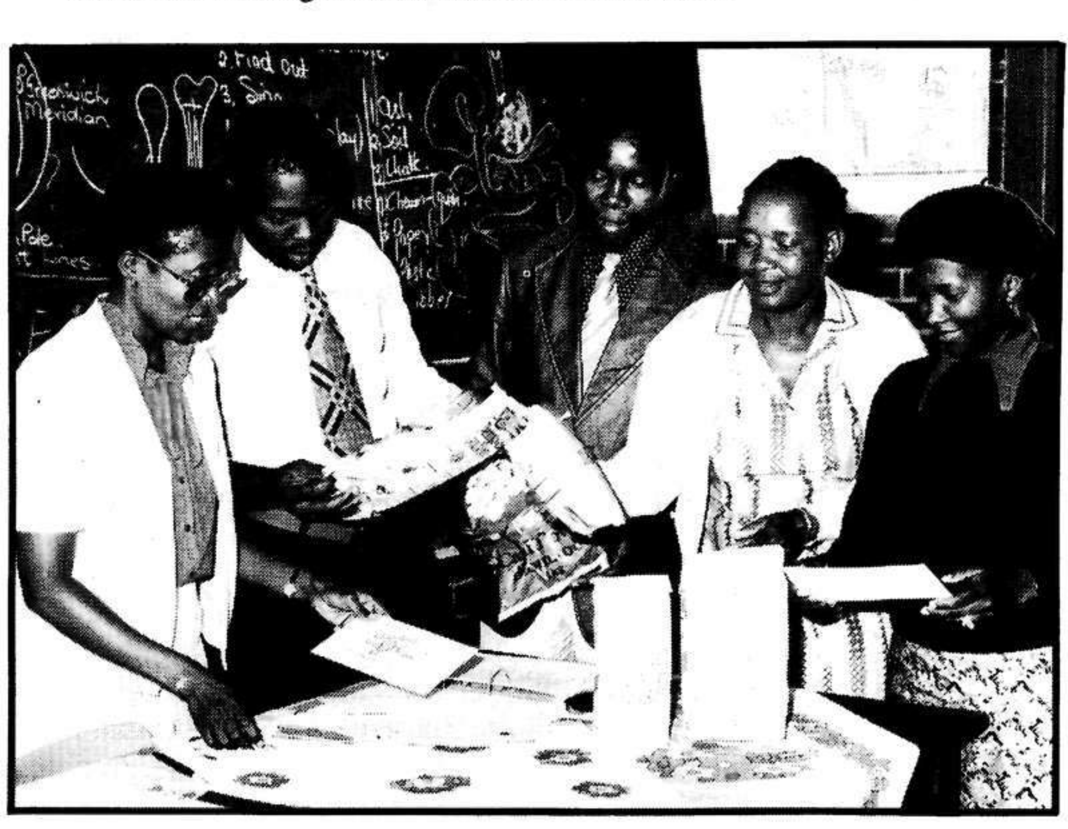
Nutrition intervention programmes are an aspect of primary prevention

introduction of specific intervention measures through better nutritional practices; improvement of health services, early detection and diagnosis; pre-natal and post-natal care; proper health care instruction, including patient and physician education; family planning; legislation and regulations; modification of life-styles; selective placement services; education regarding environmental hazards and the fostering of better informed and strengthened families and communities.