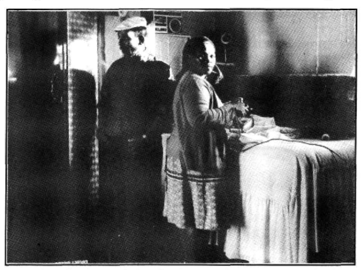
Everyone has the right to shelter, freedom from hunger, access to health care, work, education, rest, and various social services.