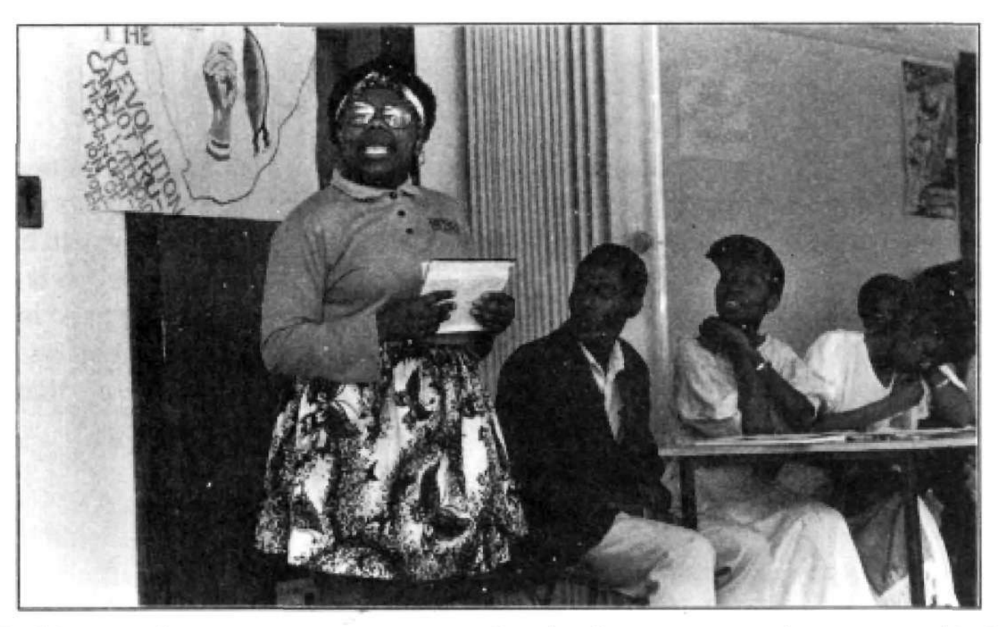
Health committees can act as a means whereby doctors are put in contact with the communities real health problems.

To promote awareness amongst community members about health.