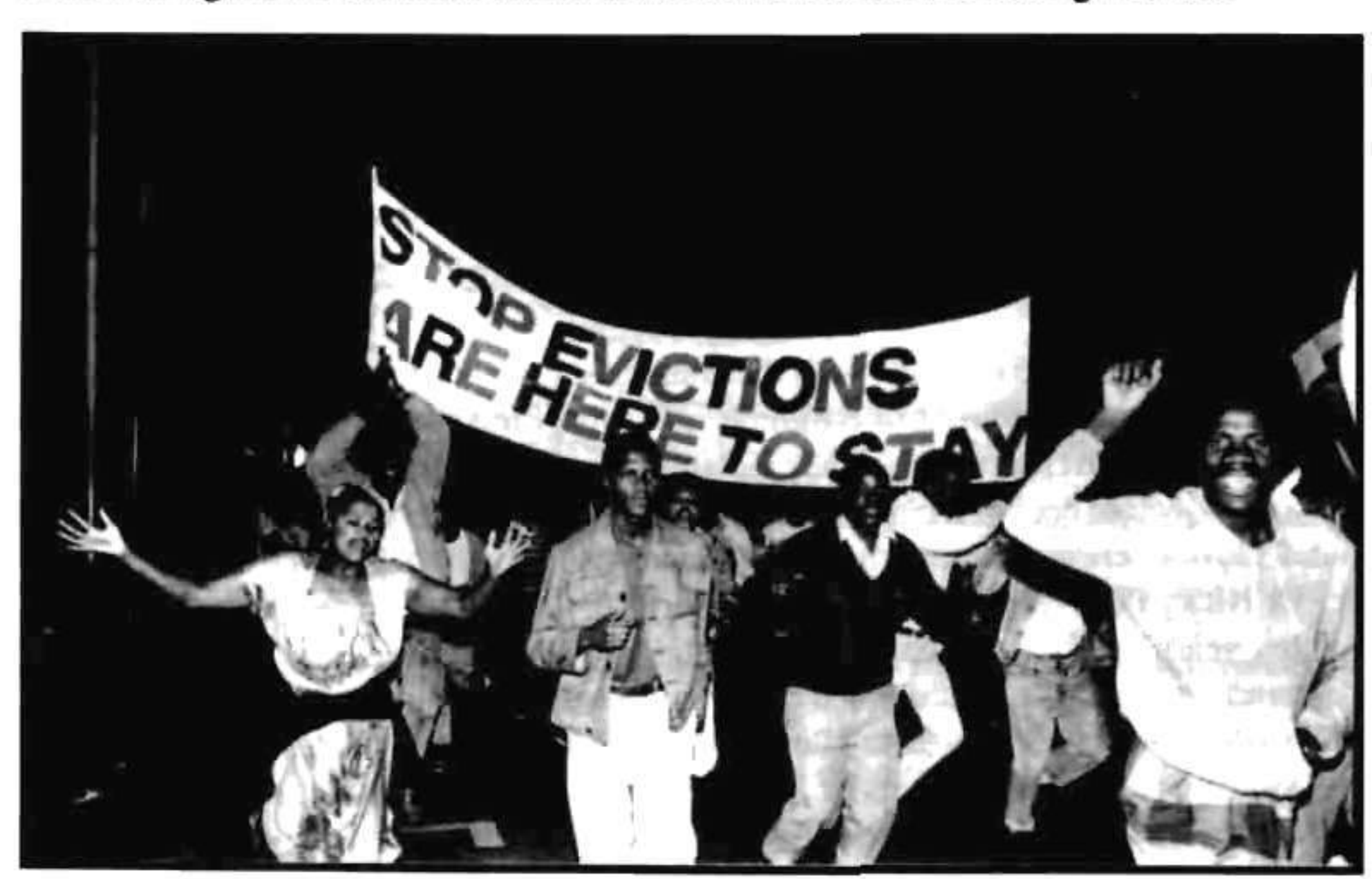
Angry residents protest against the eviction of 12 black families from a block of flats in Hillbrow. In defiance, they then moved the belongings of the families back into the flats.

Evictions can also cause health problems. This year, several people were evicted from a building in Berea. Actstop supplied tents for the people but these were pulled down almost immediately by the police. The evictees were later moved to a church where there were not enough toilets, and living space was at a premium. Evictions often occur during the winter and families are left on the street in freezing weather.