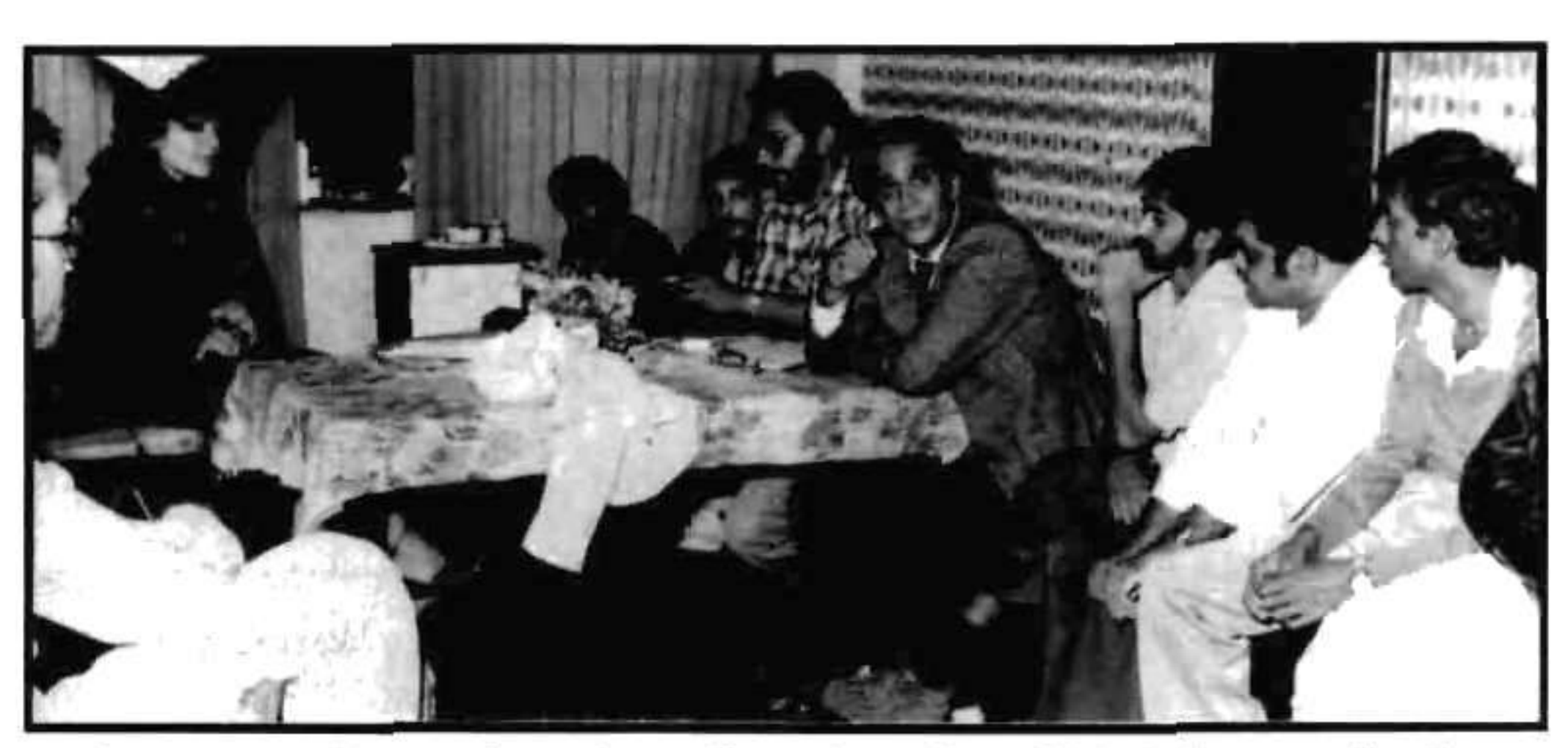
Actstop meets with tenants' committee to discuss the problems of living in "grey areas" under apartheid.