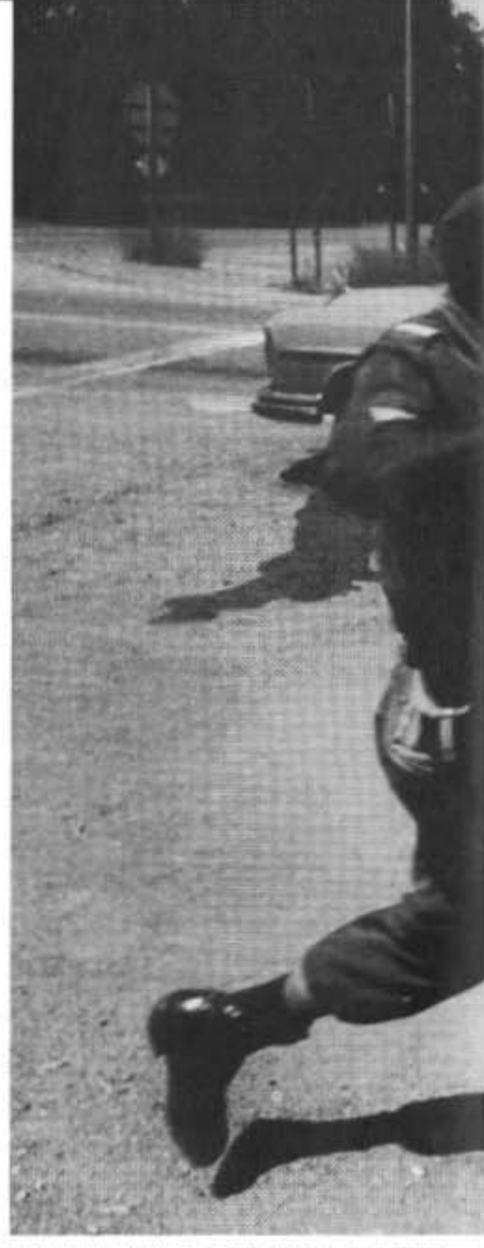
MOMENT OF DEATH: Militant activism goes

The point I am making here is that growing threats of violence and civil war are not coming from some innate disposition to fight and kill peculiar to the right, but from a normally civil nature that feels backed up