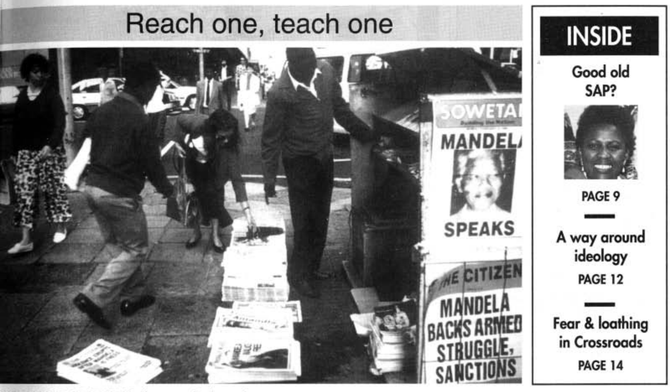
MIRRORS OF SOCIETY: No place to teach tolerance?