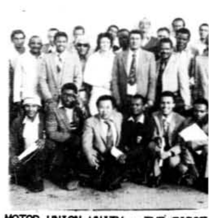
MOTOR UNION UNITY - THE FIRST