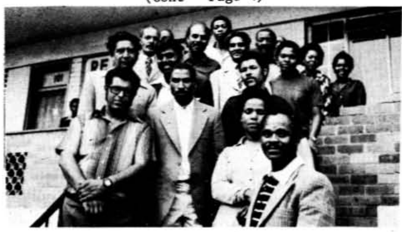
"Clean up" committee men before court settlement