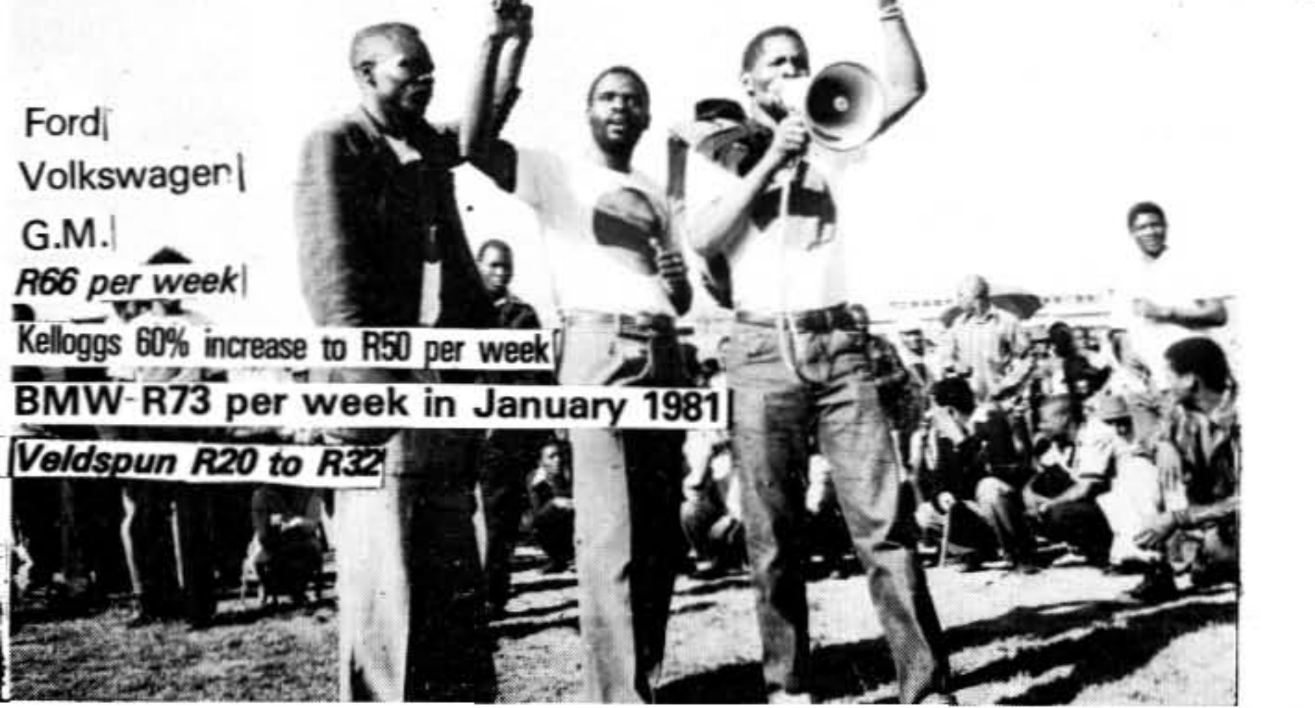
Worker unity and organisation have begun to succeed minimum wages rose ...