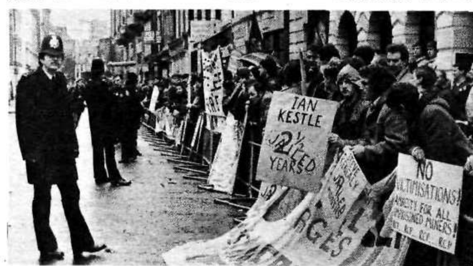
NUM supporters wait as the union executives vote to end the strike

Most important of all, they have shown the need for workers' unity both nationally and internationally.