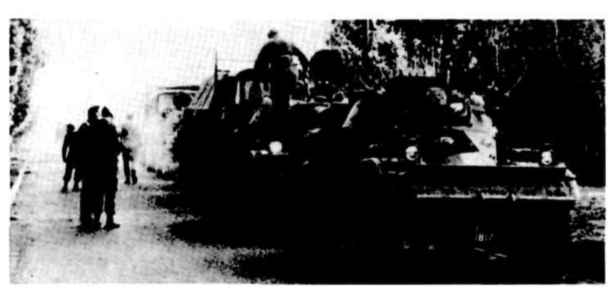
10 Eland armoured-cars on the road to the operational area (mid 1982)

"Zulu", "Foxbat" and "Orange," swept northwards capturing town after town. Within a short time they occupied the whole of the centre of Angola, the northernmost line of occupation stretching from Lobito to the capital of the Moxico Province in the east.