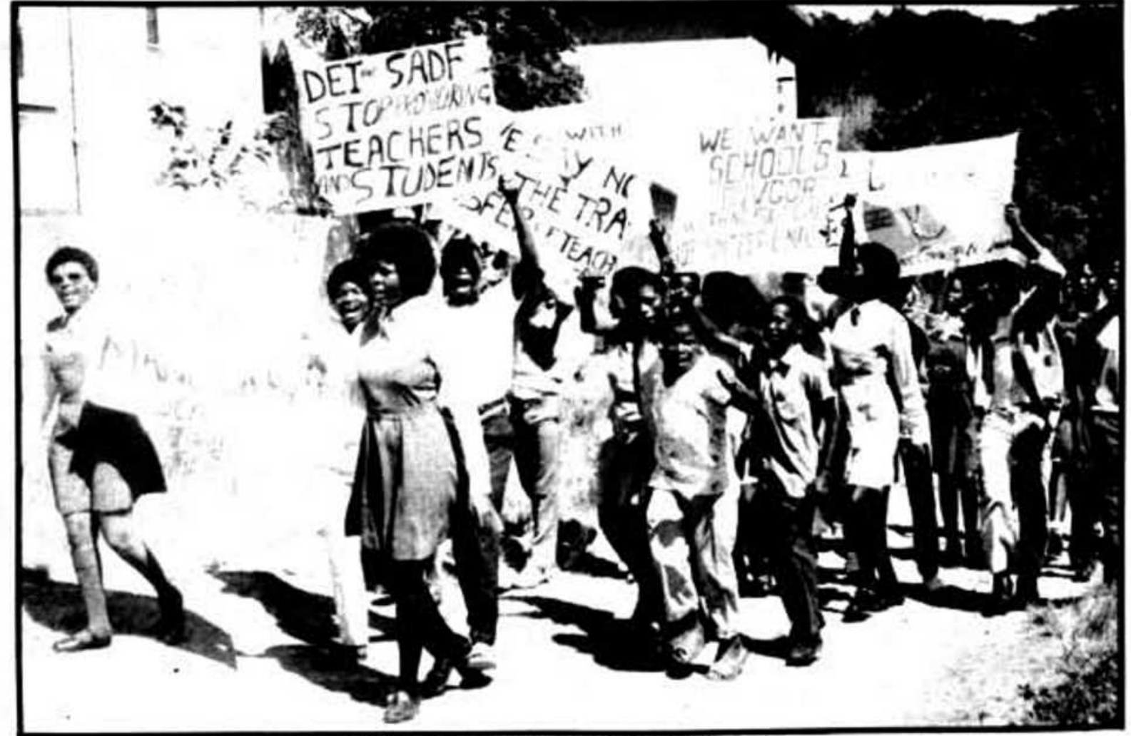
Eastern Cape students set out their demands

"By going back to school, students were in a more powerful position to