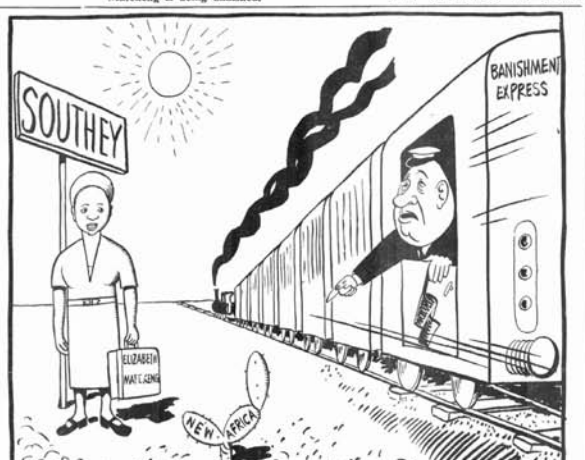
DE WET NEL: "I told them this wasn't a desert. Something is growing right there next to you!"