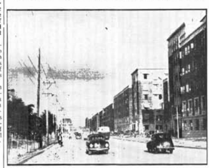
The same district after reconter reconstruction, with new flats for the workers lining a broad boulevarde.