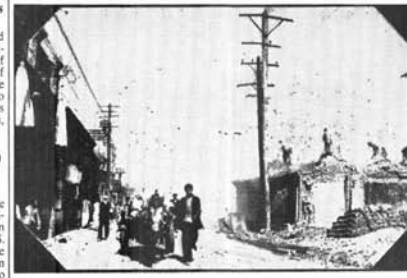
Old dwellings are smashed to the ground in a district of Peking, capital of People's China.