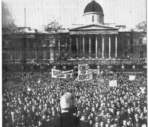
Father Trevor Huddleston addressing the enormous crowd which gathered in Trafalgar Square, London, to launch the boycott of South African goods.