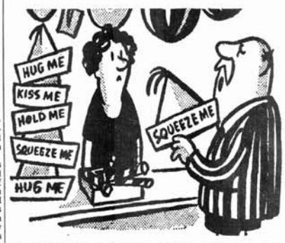
"Do you have one that says "Squeeze the workers"?

upholding the dignity of labour." Other conference resolutions called for the right of freedom and total liberation of the peoples of Africa, Repression of the workers in Algeria, South Africa, Central Africa and Portuguese Africa was denounced. Conference noted with concern that is some of the newly Seeggal, Dahomey Cameroon Togo Upper Volta, Ivory Coast and Niger Irade unions were being suppressed. trade unions were being suppress