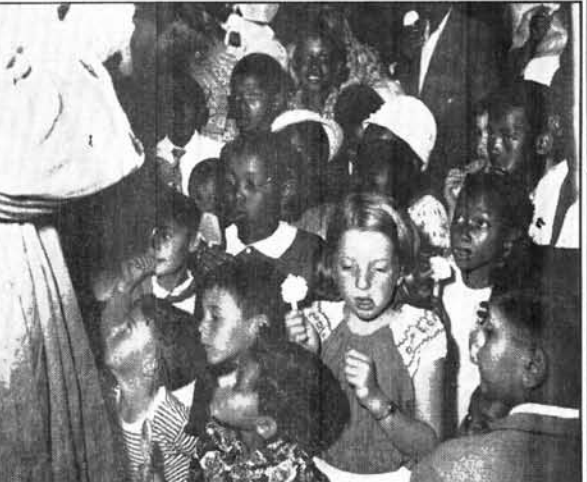
What's more interesting? Fither Christmas or an all-day sucker? These youngsters are the sons and daughters of treason trailists who attended a Xmas party organised by the T.T. Defence Fund.