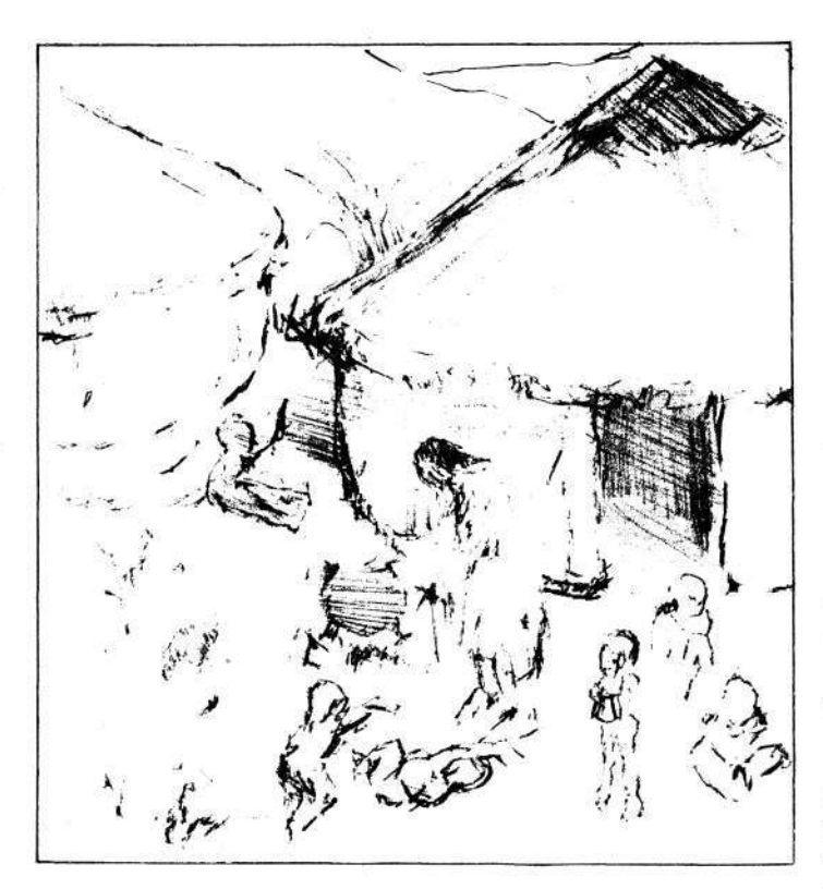
Rural Responsibility for the unwanted

In the original draft bill of 1973 provision was made for abortion for girls of under 16 years; in the 1975 bill they are excluded unless they are idiots or imbeciles. Can it seriously be argued that some purpose is served by forcing these girls, children themselves, either to go through with a pregnancy or to seek unskilled help? In the first alternative, this agegroup is exposed to greater complications of pregnancy and delivery and of course usually to the psychological trauma of giving their babies up for adoption, if such adoption opportunities exist. As far as the African and Coloured girls are concerned it is virtually impossible to arrange successful adoptions, and the babies are frequently handed over to poor foster parents or grandparents who, by virtue of age and socio-economic conditions, are not suited to the rôle of guardians of young babies. It is pertinent that the Medical Officer of Health of Cape Town reported in 1973 that 75% of Coloured teenage births were illegitimate and that the greatest increase in illegitimacy occurred amongst 13 year-olds.