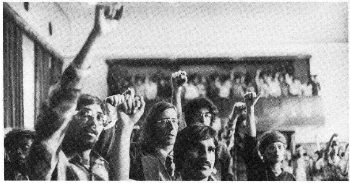
Republic Festival - Two Salutes