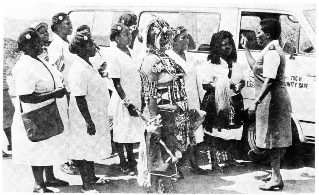
Sister Shange and Onompilo including Isangomas

(a TB Hospital), malnutrition, tuberculosis and other diseases were rife. While these diseases still occur in the area, there appears to have been a decline since these projects were initiated. As an extension to the work and to further consolidate the philosophy of securing active involvement from the local people, the Community Care project, aimed at training Community Health Workers was launched as a joint project in 1980.