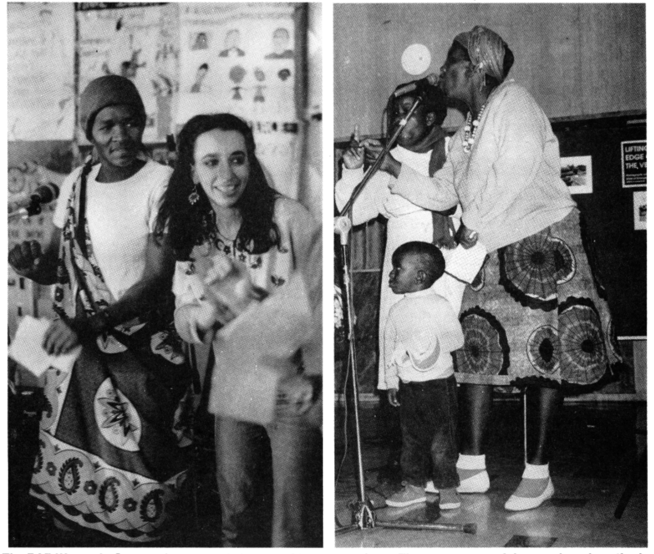
The PAP Women's Group raise women's issues with strong voices. These are some of the members in action! Photo: Afrapix Photo: Afrapix