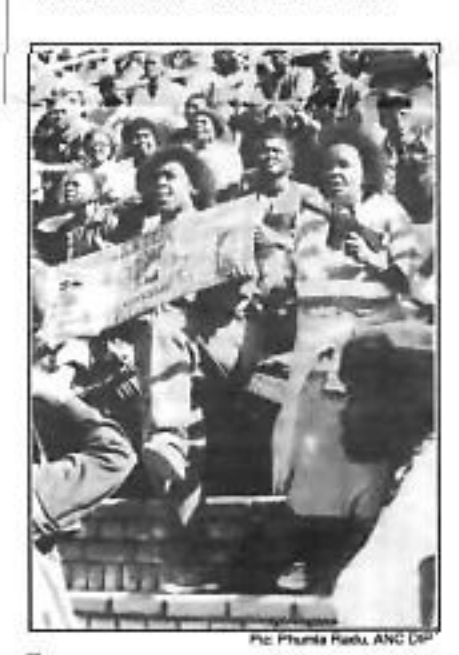
Part of the tens of thousands of Mourners at FNB Stadium

Fighter, revolutionary, soldier for peace, we mourn deeply for you. You will remain in our hearts forever.