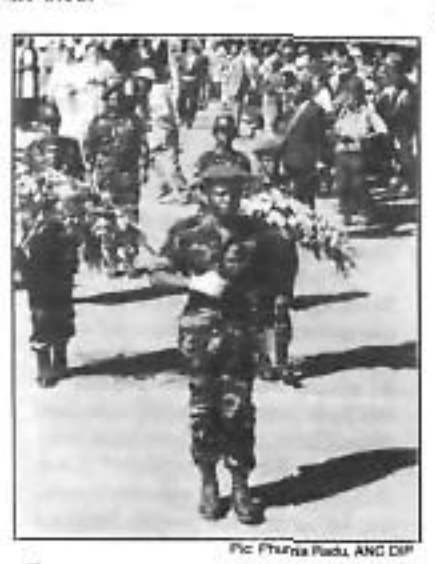
Flower-carrying MK Combatants leading cortege

This is what he stood for, and for this he died. 55