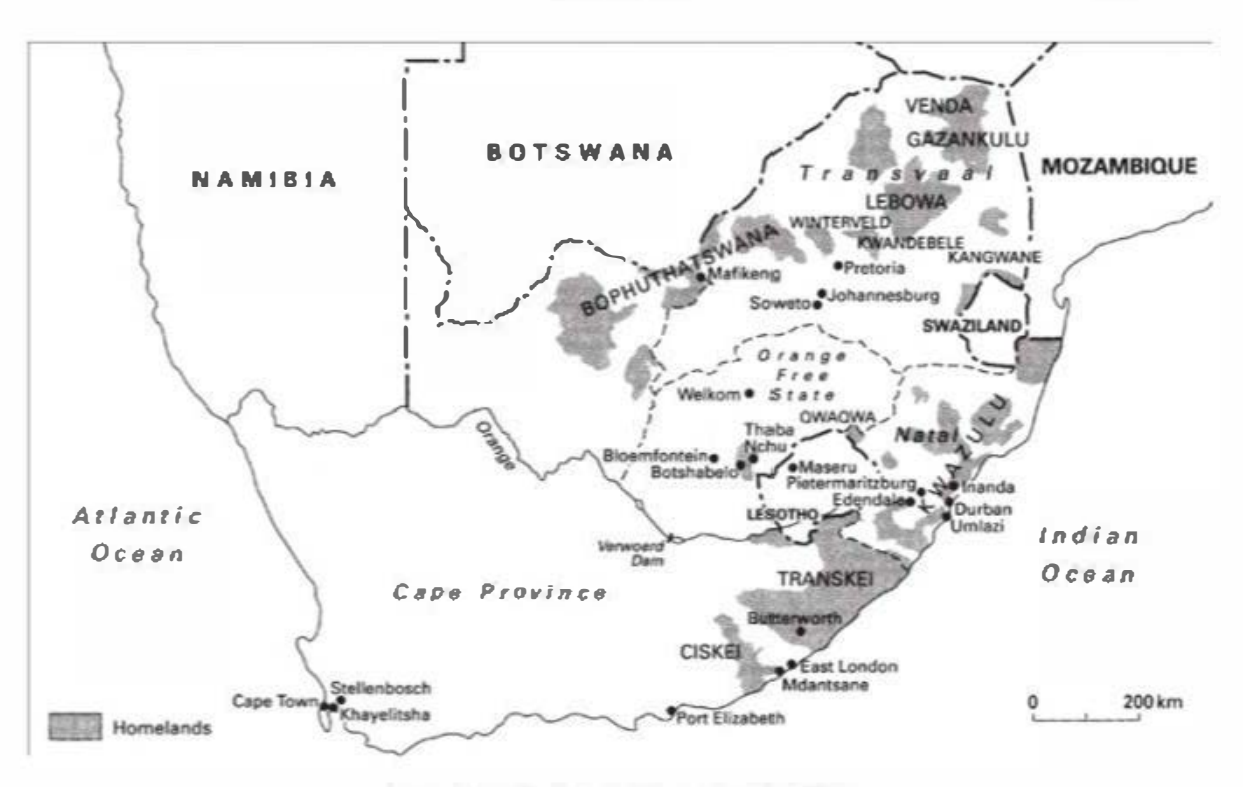
Hamelands in Apartheid-era South Africa.

imperfect one. Unlike white South Africa and many other colonial regimes, Zionists never banned miscegenation or kept the people they had conquered as servants in their homes. Nor did they rely on others to build the Jewish state they dreamed of.