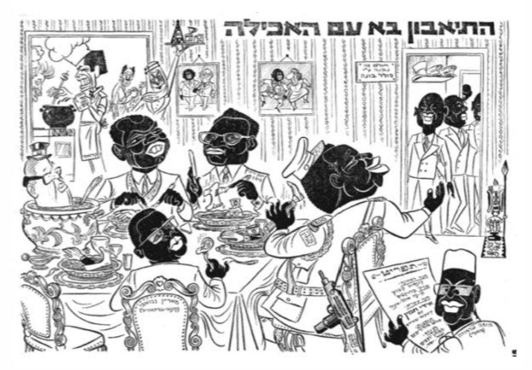
Haaretz, January 12, 1973.

The cartoon, with its caricatures of cannibalistic African leaders, was so politically incorrect that even the South Africans decried its "sheer racialism" and compared it to "the anti-Semitic cartoons of the Nazi era." 65