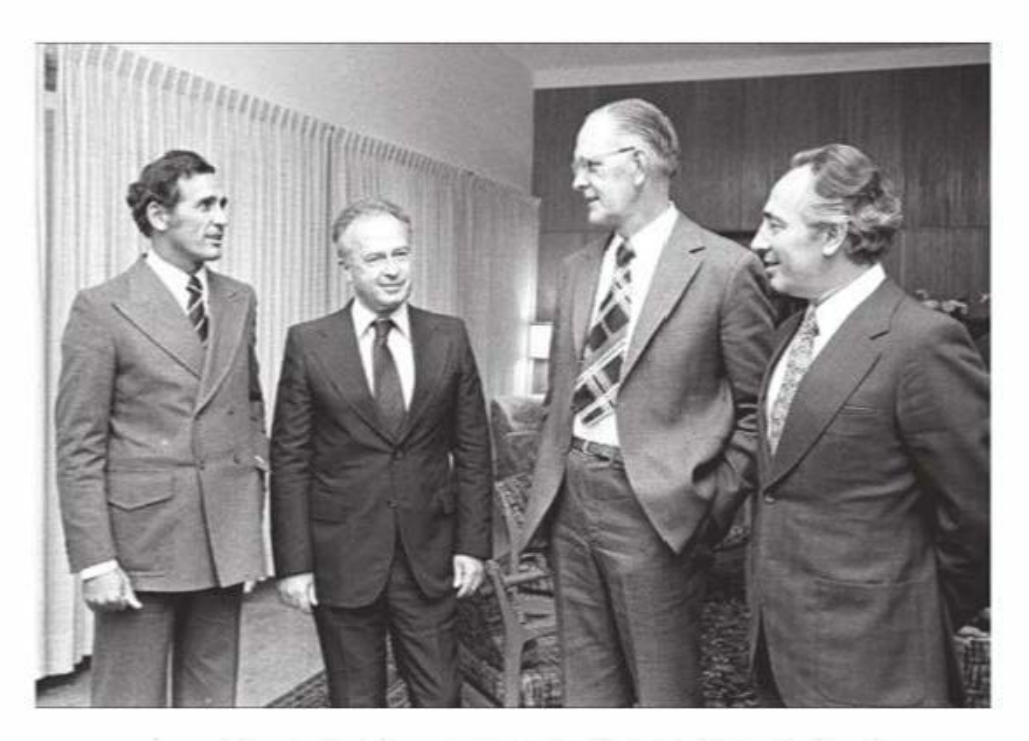
(From left) South African propaganda chief Eschel Rhoodie, Israeli prime minister Yazbak Rahin, South African intelligence head Hendrik van den Bergh, and Israeli defense minister Shimon Peres at the Prime Minister's Residence, Jerusalem, April 11, 1975.

Three days later, on April 3, 1975, Peres and Botba signed a security and secrecy agreement governing all aspects of the new defense relation-