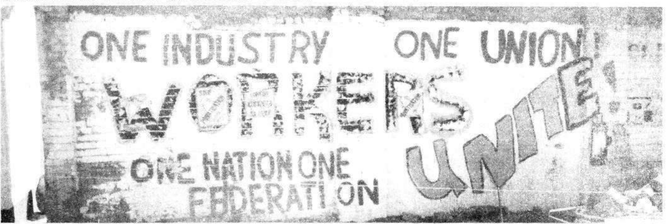
Trade Unions Graffitti: Windhoek 1989.

This has caused some unionists to question the validity of national reconciliation. "With all this talk of mixed economy and national reconciliation, the employers think they have the right to carry on as they used to, "says one union official. "They are abusing the policy of reconciliation."