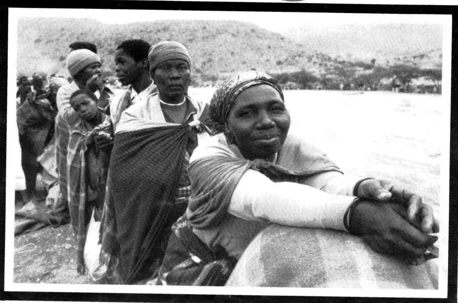
A JOURNAL OF LIBERAL AND RADICAL OPINION