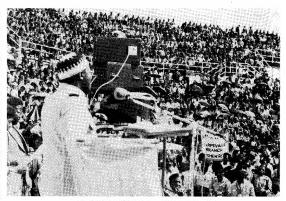
Jabulani Amphi Theatre - Jo'burg (Soweto).

Attaching ethnic tags to liberation movements instead of studying their political action programmes has long been the past-time of some commentators on African political affairs. Consequently, some political observers still