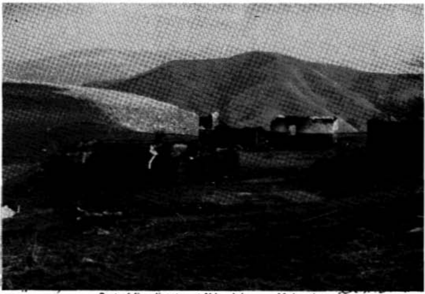
Part of fire disaster at Ndundulu near Melmoth

The Community Mobilization and Co-ordination Committee looked after the involvement of the community as a whole and also building strong community organization. There are five emerging Inkatha Branches who were incorporated into this programme and also this committee got together all outside wellmeaning parties vis.