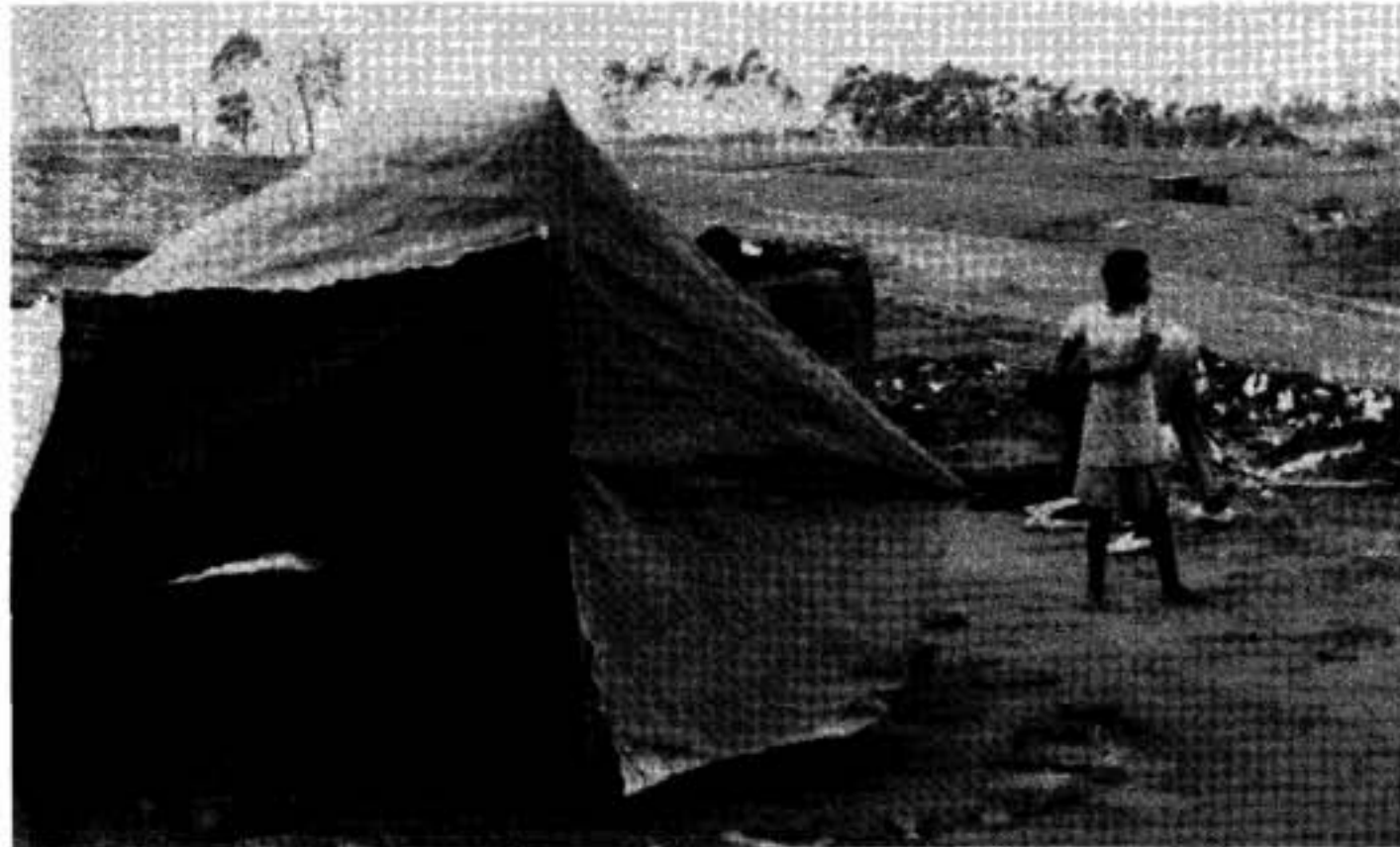
Tents that were given to the people

The Bureau for Community Development and Youth Affairs runs the Amabutho Follow-up programme. This programme entails the placement of Amabutho who are through their training at various Government Departments' offices and projects and also the organization of localized workshops to strengthen Amabutho participation in projects in their communities. The Amabutho are naturally grouped into three, namely: