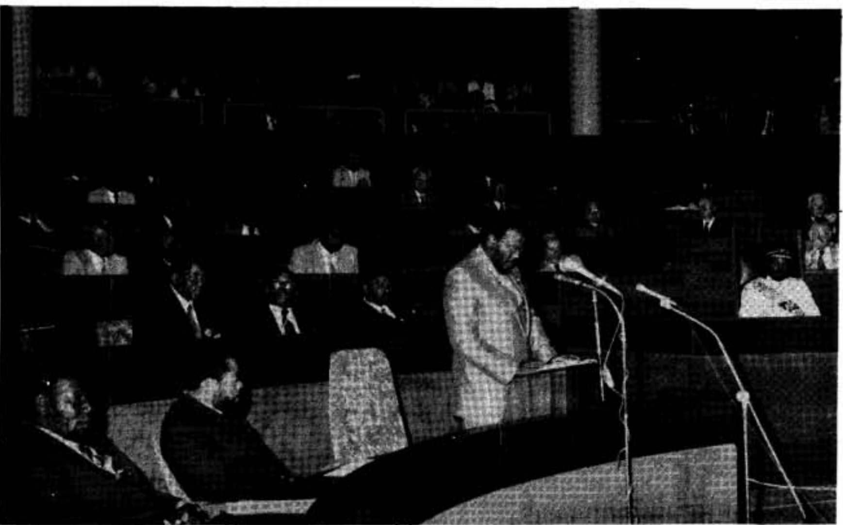
KwaZulu Legislative Assembly

The KwaZulu Legislative Assembly debated the issue and adopted the following motion: