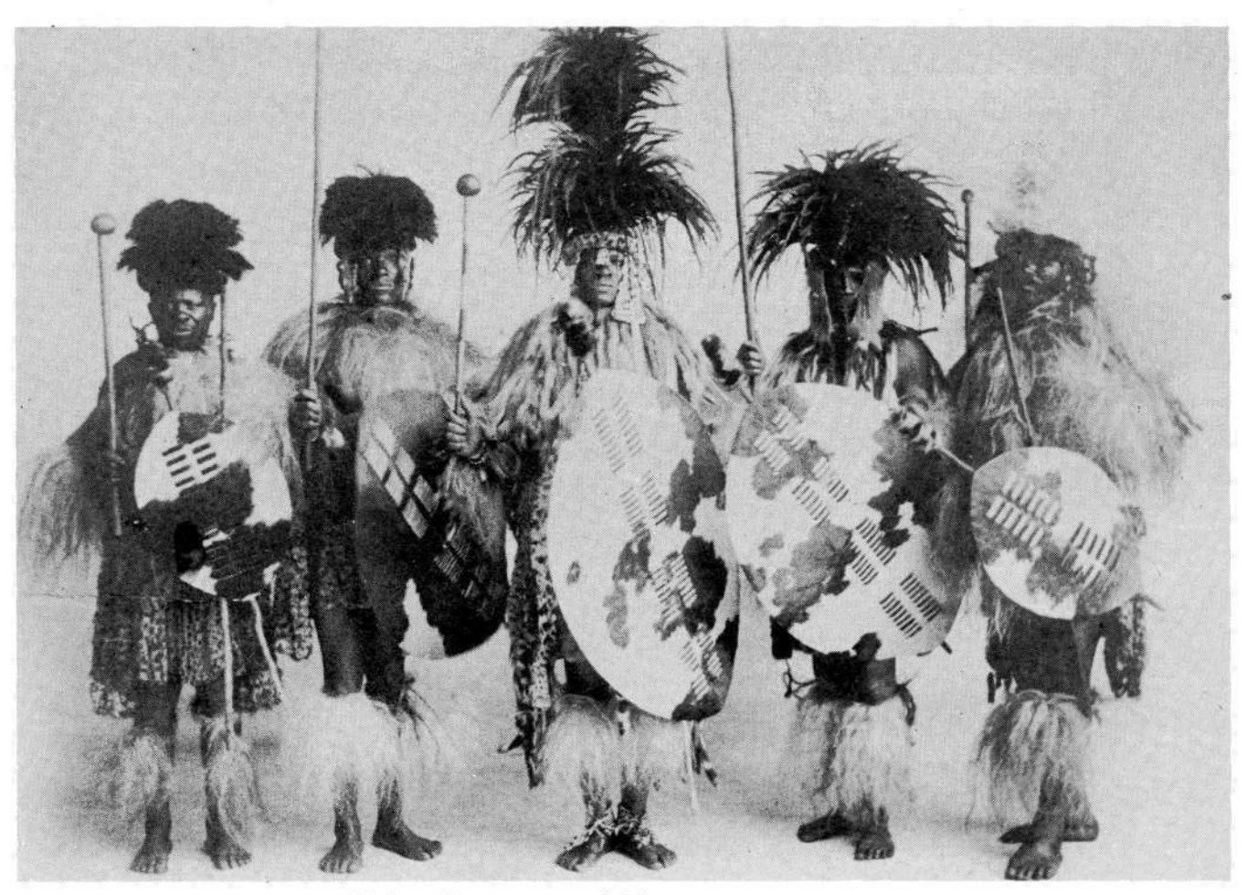
A rare 19th-century photograph of Zulu soldiers in ceremonial dress.

violence as in the Langalibalele incident in Natal in 1873. Officials in London looked at the situation in southern Africa with concern. It seemed as if there was sufficient locally generated wealth to provide a sounder, more secure, system of government: however as long as the region was divided into different political systems there was no chance of bringing into being the overall control required for the development of southern Africa. By his confederation scheme Carnavon hoped to break down the political divisions between the British colonies, Boer republics, and independent African states and communities. Once this was done, and the people of southern Africa brought under centralised control, it would be possible to build the infrastructure needed for the more effective exploitation of southern Africa's wealth.