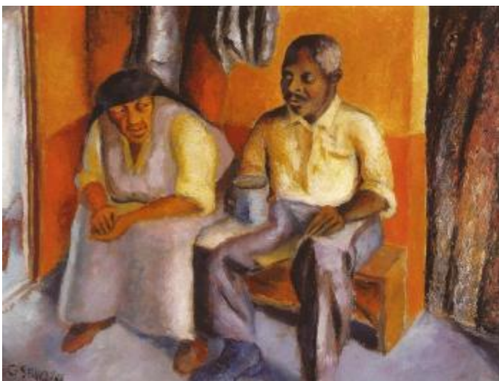
Gerard Sekoto, 'The artist's mother and stepfather', undated. Oil on canvasboard. 30 x 40 cm. The Campbell Smith Collection.

When I think about figures from the art world who might qualify as heritage icons and cultural treasures, the artist who immediately comes to mind is Gerard Sekoto (1913-1993), followed by Dumile Feni (1942-1991) and then perhaps Cecil Skotnes (1926-2009). In all likelihood, many would agree with me here, particularly in respect of Sekoto, as he is fêted by just about everyone involved with the South African art world.