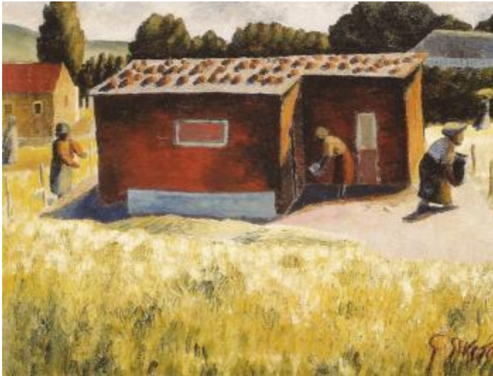
Gerard Sekoto, 'Women working outside a house', undated. Oil on canvasboard. 28.5 x 39 cm. The Campbell Smith Collection.

they lived in the slumyards and townships of Johannesburg – they were the black working class.