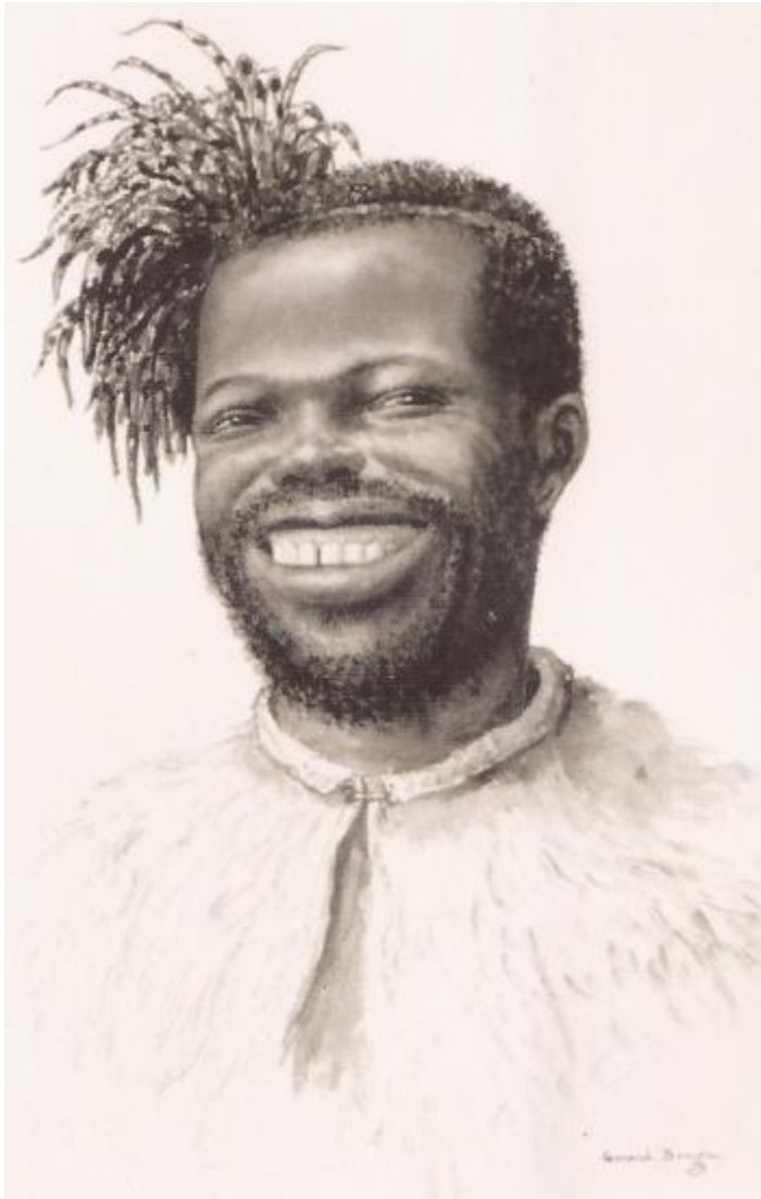
Gerard Bhengu, 'Smiling Young Man with Feathered Headdress', undated. Watercolour and ink on paper. 25 x 16 cm. MTN Art Collection.

Mohl never explained what he meant by "not speaking in the spirit of apartheid or submission." What could he possibly have meant? Well, what he was probably referring to was a strong trend in the art market at the time. Somewhat in tandem with the colonial and apartheid view that blacks were a 'breed' apart, what many white collectors expected of black artists was an art that, through their eyes, represented cultural apartness, if I can put it like that, or what was called "native studies". And such works were those depicting the 'authentic', mystical and exotic African, showing 'tribal' life and customs – something like we see in Gerard Bhengu's 'Smiling Young Man with Feathered Headdress' (undated).