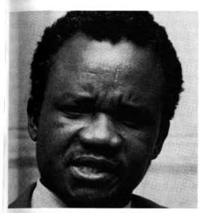
1991: Frederick Chiluba of Zambia took over reins of power peacefully.