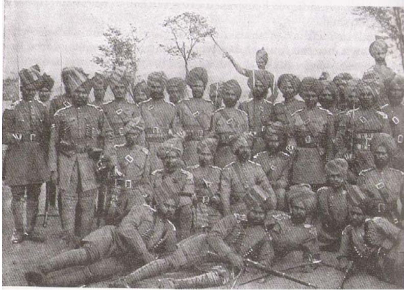
Figure 3: Bengal Lancers at the Kroonstad Remount Camp. As shown here, certain of the Indian forces carried arms, as they were part of the Indian Army.