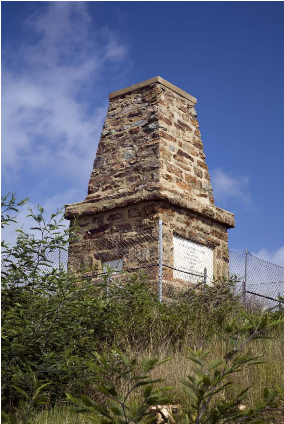
Figure 2: The Indian Monument on Observatory Ridge in 2009