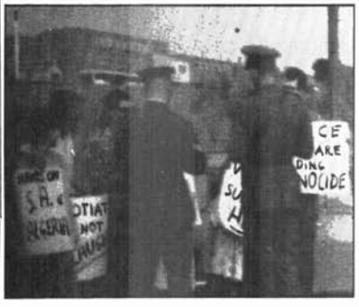
Police question Congress demonstrators carrying placards reading "Hands off South Africa and Algeria" and "France, you are aiding genocide,