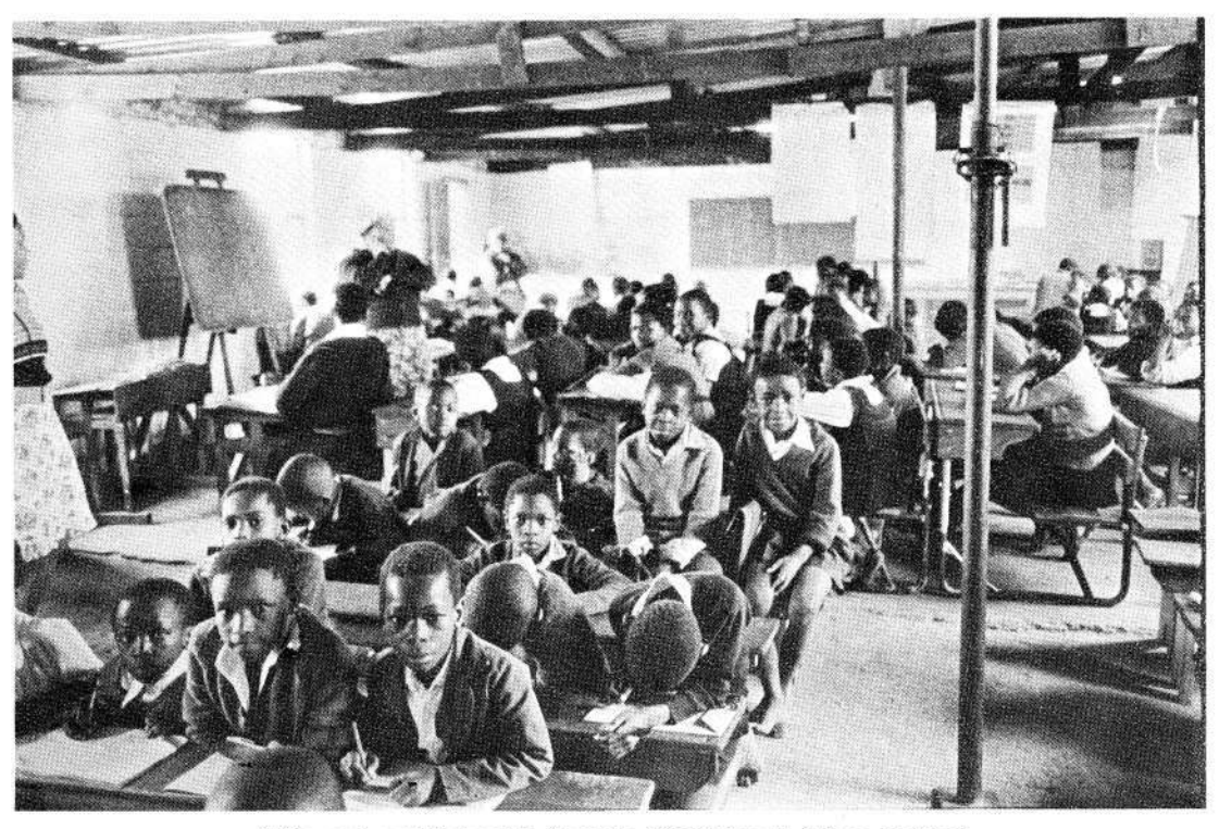
A Department School in Pretoria West Circuit. Three distinct classes are in session.

In the meantime it is crucial to inspect with care the modalities that have produced Bantu Education. We must try to comprehend the motivation of people involved, the political and class positions of those who confirm and those who challenge Bantu Education. A fundamentally abusive system sets up complex tensions and currents of feeling in people;