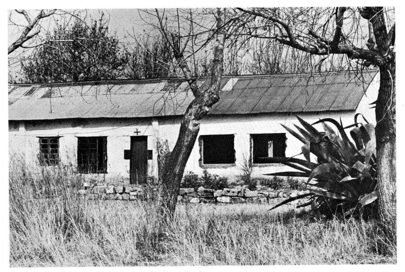
Bultfontein school now derelict three years after it was closed.

and it is in this turbulence that we must look for the possibility and direction of change.