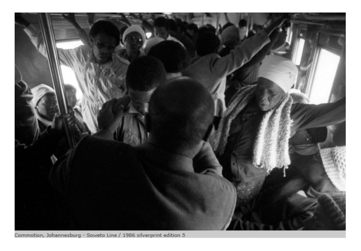
Figure 3: Santu Mofokeng Train Church, 1986

Thus there emerged a number of projects the reasserted the humanity of the oppressed through everyday imagery. In Mofokeng's Train Church series, for example, he captured the prayer and church activities in commuter trains from Soweto to Johannesburg, drawing from everyday urban life and the routine of commuting alongside the prevalence of spirituality. This was incredibly unusual given the fact that it was produced at the height of the political struggle.