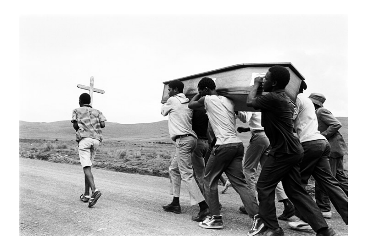
Figure 2:Cedric Nunn Funeral of two comrade youth abducted and killed in the "Natal War," 1987

'enunciated the boundary between presence and absence, visibility and invisibility<sup>42</sup>.' Documenting forms of popular resistance against the injustice propagated through apartheid as well as the violent state responses to this challenge, this approach produced some of the most iconic imagery of the time.