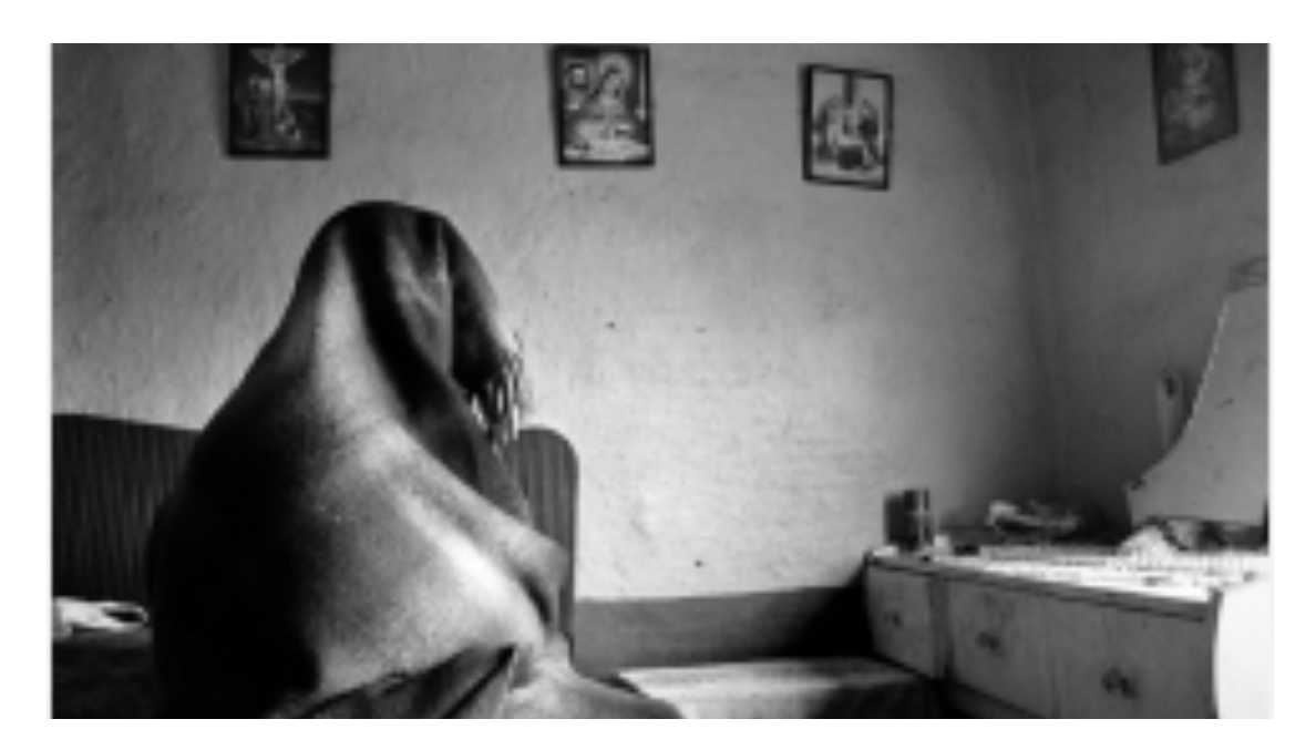
Figure 11: Cedric Nunn, 1987

Therefore, although there is a clear shift away from the more humanist documentary of the everyday, these are not the one-dimensional, stereotyped images propagated by the mainstream media. Whilst television news was in favour of the large gatherings, defiance and violent confrontation that many of these images capture, the complexity of the South African situation, as represented through the photographic essay, was not sacrificed in the process. The personal involvement and commitment of Afrapix photographers within the struggle was significant in the way they shaped the way they visually represented South Africa and apartheid through the compilation of imagery. As Graham Goddard observed,