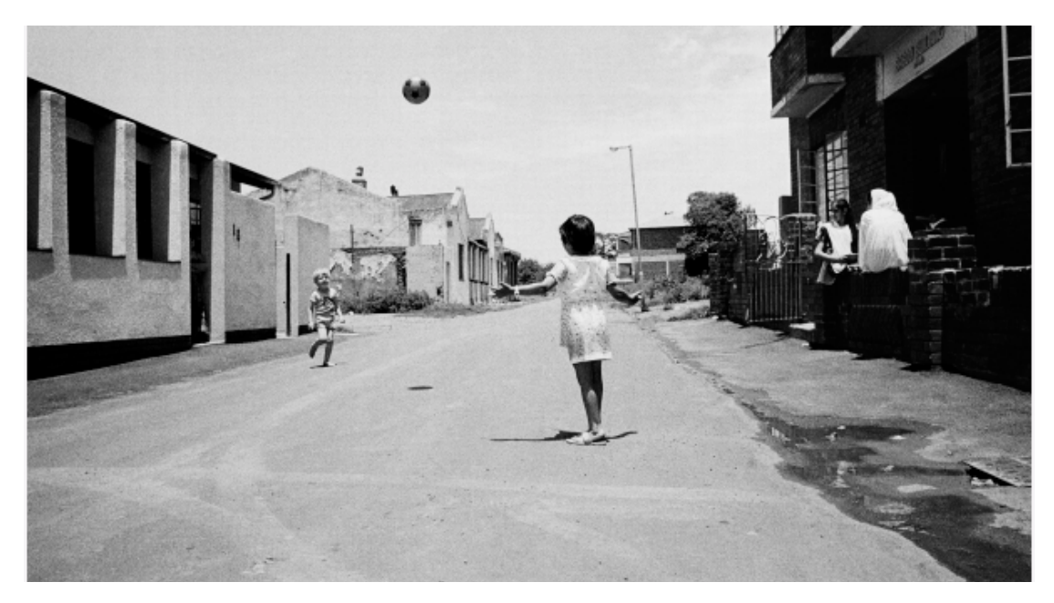
\label{eq:Figure 7: Paul Weinberg} \textit{Pageview, Johannesburg, at the time of apartheid removals, June 1982.}

It was this sentiment that shaped the way in which Afrapix documented apartheid and its communities, highlighting a sense of personal agency amongst the oppressed population, as conveyed through their daily endeavors. This further encouraged a shift away from the stereotypical association of the black communities solely as victims of apartheid, to show that the oppressed were not confined within the structure of apartheid. As Badsha said: 'you want to try and move away from that we are just victims. To say that we are, each one has dignity and must be approached with dignity and photographed with dignity<sup>64</sup>.'