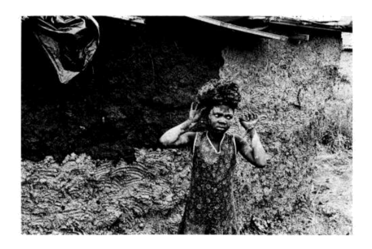
Figure 4: Omar Badsha Plastering home with Mud in Inanda, 1982

Omar Badsha has also produced powerful work centered on the everyday. Letter to Farzanah <sup>55</sup>, for example, documents the lives of black and white South African children, illustrate the ordinary lives of children under apartheid whilst exposing the more universal issue of disparity and racial divides through the juxtaposition of wealthy children with those living in squatter camps. Badsha's later publication, Imijondolo <sup>56</sup>, is another example, documenting the everyday lives of the impoverished Inanda residents, representing the subjects with dignity whilst exposing the harsh effects of apartheid on the community.