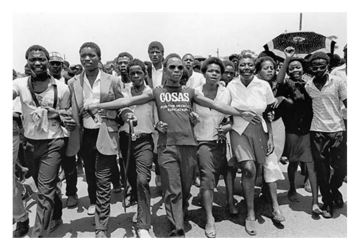
Figure 6: Omar Badsha Students marching to funeral of COSAS member, 1981

victims but also as active agents, people who are shaping the way in which history unfolds. These images aimed to inspire others to act, encouraging them to believe that they had the power to stimulate change. This was particularly significant at the time as censorship and the oppression of apartheid suppressed memories of the struggle and revolutionary politics. Images of Mandela or the ANC flag, for example, could not be published. Thus Afrapix's images of defiance were significant in reviving the memories of the resistance and instilling a sense of political agency that had been quelled by apartheid censorship.