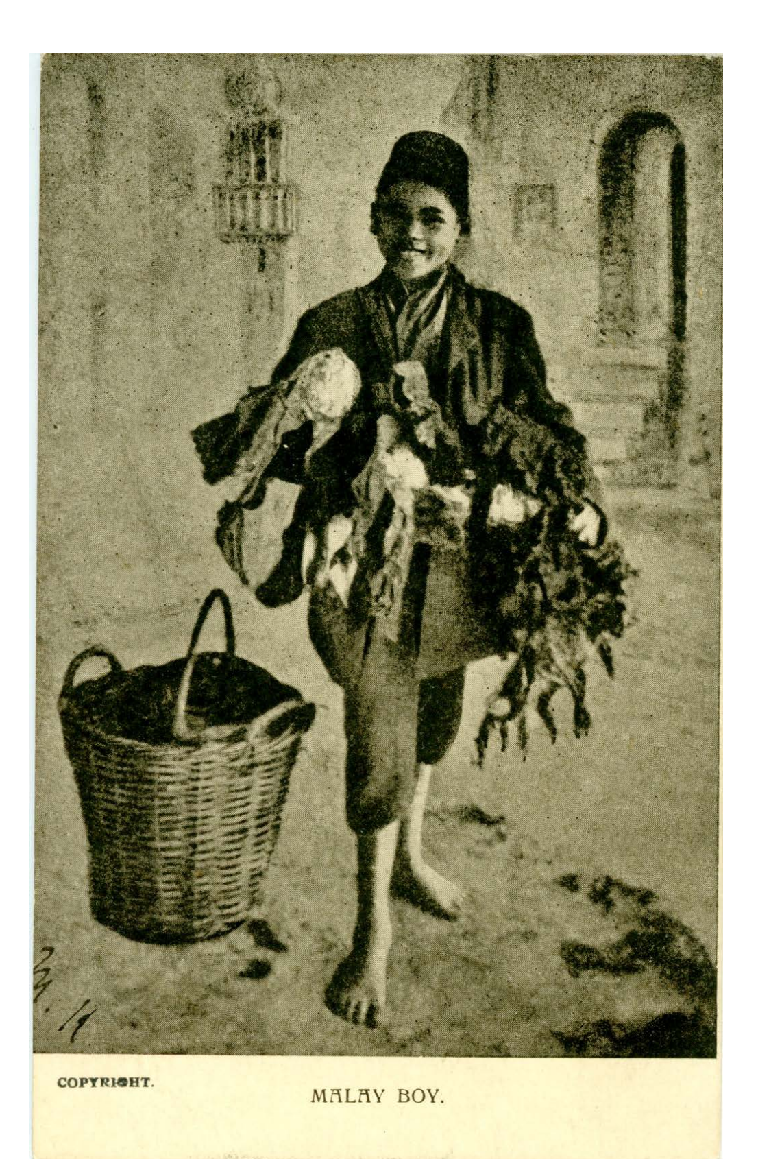
FIGURE Nº 3

Minna Keene. Malay Boy (c.1906). Postcard. Posted 1917. 9"x14". Personal collection of author.