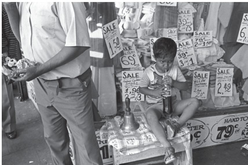
FIGURE 2 Storekeeper's son, Durban 1979

debated those issues' (Interview 2 with Omar Badsha). Indeed, Badsha was exposed to such debates from a very young age. His account suggests that this ghettoized political and artistic community was, to an unusual extent, able to 'reflect on the significance of seeing itself'. As W. J. T. Mitchell suggests, such reflection involves the attempt to 'overcome the veil of familiarity and self-evidence that surrounds the experience of seeing, and to turn it into a problem for analysis, a mystery to be unraveled' (Mitchell 2002: 231).