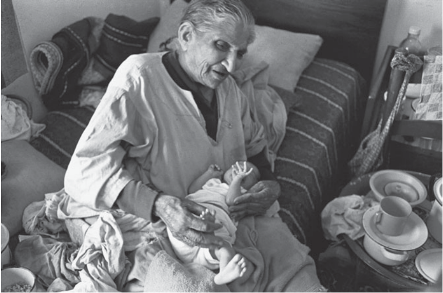
FIGURE 3 Cover photograph, Letter to Farzanah (1979)

I was photographing children, just a project of my own generally, and so when Fatima came up with this proposal I said, well I think I've got a body of work, and very naively pulled out all these terrible pictures and put them together into a book. And all of it was done again, all in I think a matter of a month or two. . . . [W]hen I was drawing, children, and women, and the mother and child was a very important theme in my drawing. It was an important theme, so I think I just progressed. (Interview 1 with Omar Badsha, edited transcript)