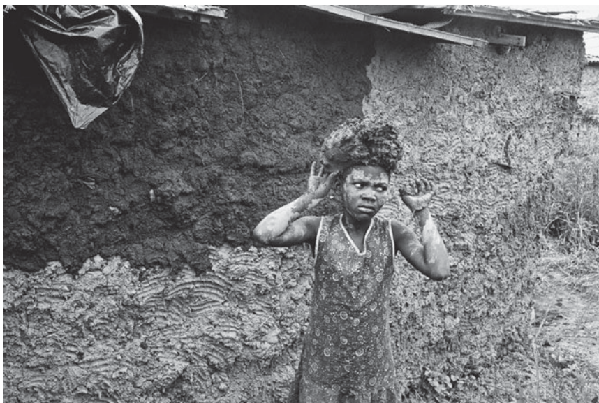
FIGURE 5 Carrying mud to plaster newly built home, Inanda, KwaZulu-Natal, 1982

himself; but he now turns the sensorium outwards, and sees the situation of others caught between rural and urban, and then he attempts to inscribe it on the film in his camera.