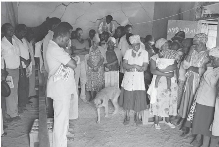
FIGURE 7 Prayers before meeting of Amouti Residents' Association, Inanda, 1982

dramatization, performance, and masquerade', since these displace the 'typical notions of reflection or mirroring' associated with phrases such as 'images of ...' (1999: 234). Pollock's point takes us back to theatre as analogy, as metaphor, of course: but in this South African case, theatre is actually part of that interface of live mediums created by activists. Moreover, from his own exploration of expressive detail in the everyday, Badsha carries over a hyper-sense of seeing (intimately connected to power) into his portrayals of various figures: actors, politicians, activists, chiefs, religious figures, and their props. His photographs of theatre performances, meetings and rituals, then travel back into the various public domains, in that bigger effort to change the parameters of the aesthetico-political regime. Here however, today, Badsha admits that his own sense of always questioning the relationships between people and power may not have been very obvious in the 1980s.