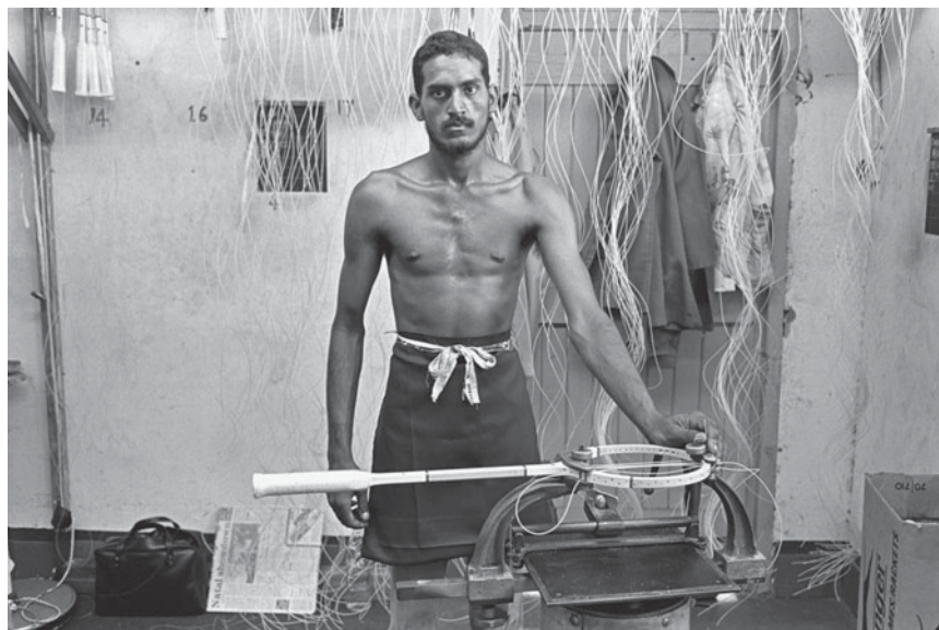
FIGURE 4 Disabled worker, Lorne Street, Durban, 1981

the photographs enter the public domain. They were originally not intended as ‘struggle photos’; their initial purpose was open, personal, even meditative.