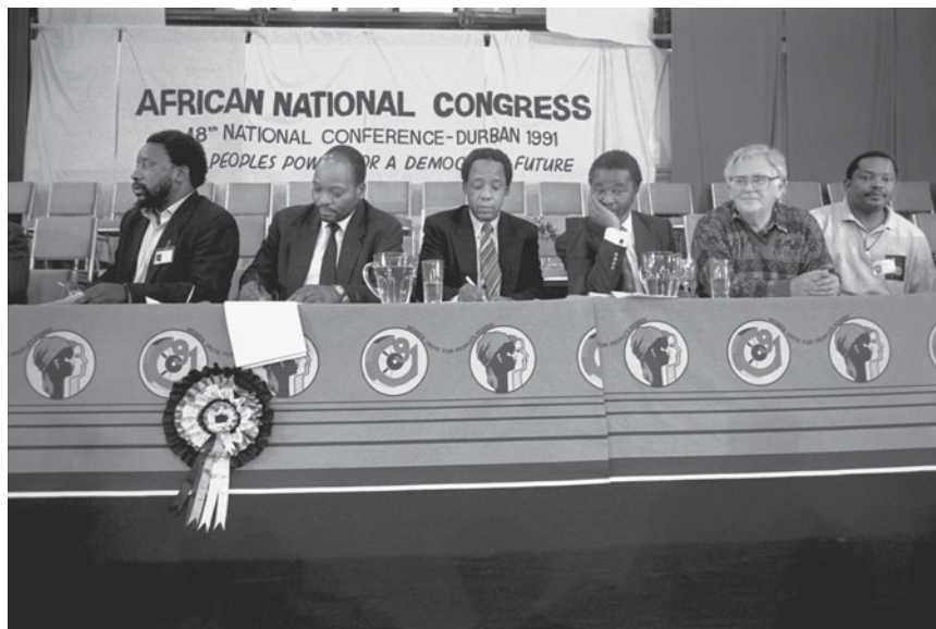
FIGURE 8 Newly elected ANC leaders, Durban, 1991

of – or perhaps because of – a childhood in a Sunni Moslem context which played down such physical, overtly embodied elements.