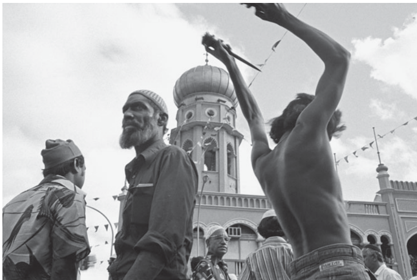
FIGURE 1 Rathi players, Badsha Pir celebrations, Grey Street, Durban 1980

people – indentured workers] and the transferring of traditions and rituals and use of public space in the creation of identities. 1