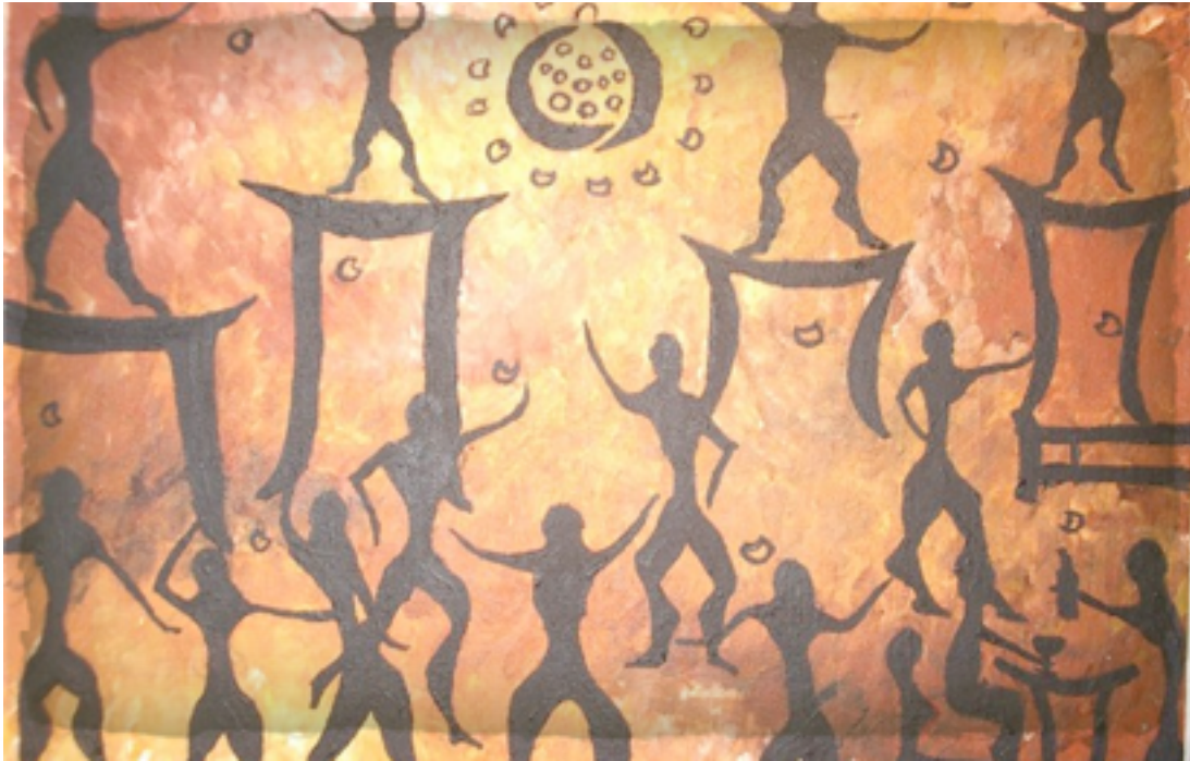
Modern artwork from a club.

In Medical terms it comes from the Latin masturbari : “to pollute oneself from L.manus [hand]” and stuprare/turbare: “to defile with the hand, to disturb, agitate or rub”. The Greek word is mezea – the stimulation of organs that usually leads to orgasm. This is the whole Kundalini awakening without a partner, but can be activated in a group setting through ecstatic rituals. Witches call it the ultimate blasphemy against God.